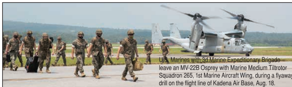
U.S. Marines with 3d Marine Expeditionary Brigade leave an MV-22B Osprey with Marine Medium Tiltrotor Squadron 265, 1st Marine Aircraft Wing, during a flyaway drill on the flight line of Kadena Air Base, Aug. 18.

The JHAST is the expeditionary command team in charge of the U.S. military’s response to requests for humanitarian assistance. The JHAST remains on call and ready