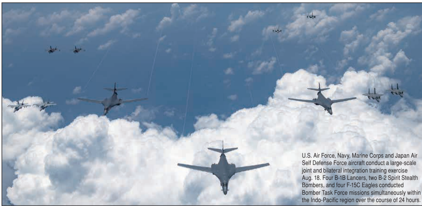
U.S. Air Force, Navy, Marine Corps and Japan Air Self Defense Force aircraft conduct a large-scale joint and bilateral integration training exercise Aug. 18. Four B-1B Lancers, two B-2 Spirit Stealth Bombers, and four F-15C Eagles conducted Bomber Task Force missions simultaneously within the Indo-Pacific region over the course of 24 hours.

The first display of airpower came when two B-1s from Dyess Air Force Base, Texas took off from Dyess and flew to the Sea