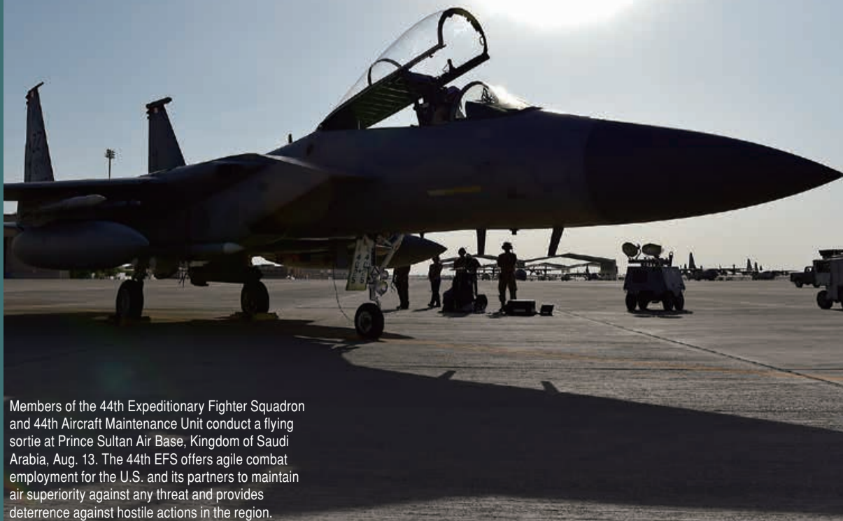
Members of the 44th Expeditionary Fighter Squadron and 44th Aircraft Maintenance Unit conduct a flying sortie at Prince Sultan Air Base, Kingdom of Saudi Arabia, Aug. 13. The 44th EFS offers agile combat employment for the U.S. and its partners to maintain air superiority against any threat and provides deterrence against hostile actions in the region.