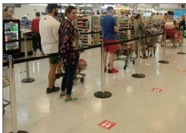
^ Members and their families stand in lines at the commissary March 30, at Kadena Air Base. Protective social distancing measures are in place across the base to ensure prevention of face-to-face contact as much as possible.