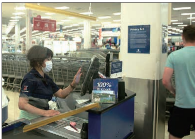
^ A base exchange worker stands behind a protective shield at the base exchange March 30, at Kadena Air Base.