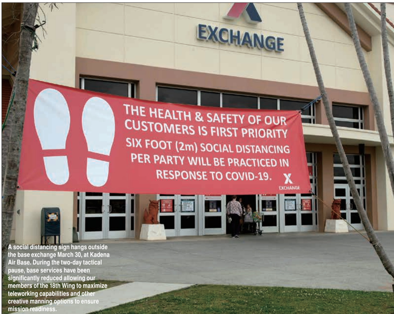
A social distancing sign hangs outside the base exchange March 30, at Kadena Air Base. During the two-day tactical pause, base services have been significantly reduced allowing our members of the 18th Wing to maximize teleworking capabilities and other creative manning options to ensure mission readiness.