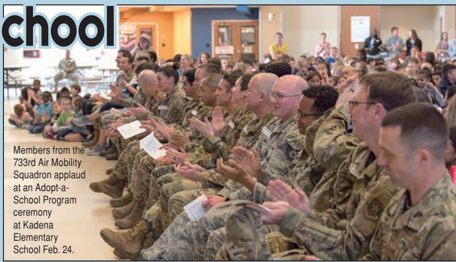
Members from the 733rd Air Mobility Squadron applaud at an Adopt-a-School Program ceremony at Kadena Elementary School Feb. 24.