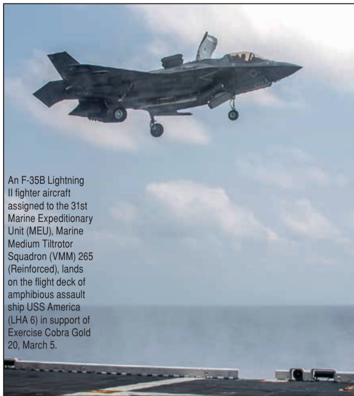
An F-35B Lightning II fighter aircraft assigned to the 31st Marine Expeditionary Unit (MEU), Marine Medium Tiltrotor Squadron (VMM) 265 (Reinforced), lands on the flight deck of amphibious assault ship USS America (LHA 6) in support of Exercise Cobra Gold 20, March 5.