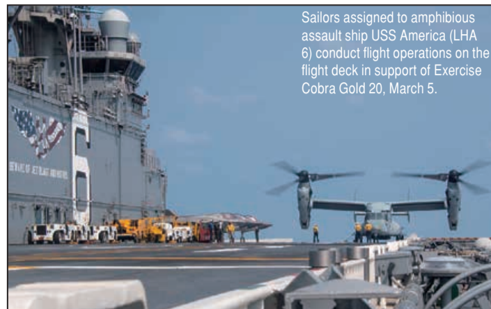
Sailors assigned to amphibious assault ship USS America (LHA 6) conduct flight operations on the flight deck in support of Exercise Cobra Gold 20, March 5.