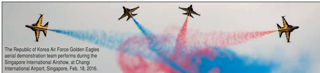
The Republic of Korea Air Force Golden Eagles aerial demonstration team performs during the Singapore International Airshow, at Changi International Airport, Singapore, Feb. 18, 2016.