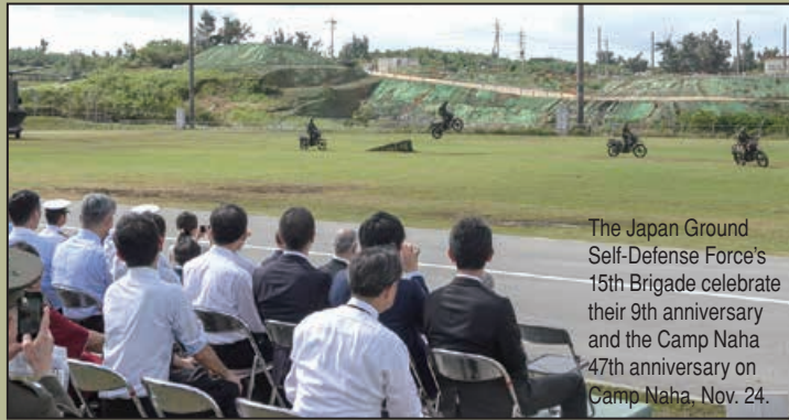
The Japan Ground Self-Defense Force's 15th Brigade celebrate their 9th anniversary and the Camp Naha 47th anniversary on Camp Naha, Nov. 24.