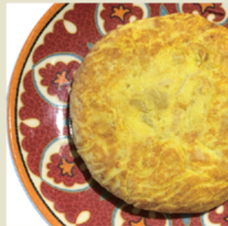
TORTILLA (SPANISH OMELET)