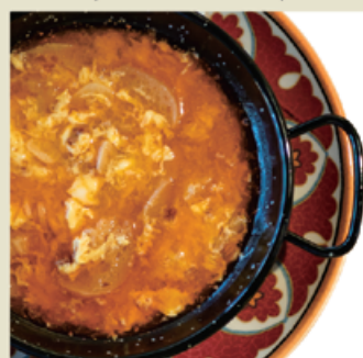
SOPA DE AJO (SPANISH GARLIC SOUP)