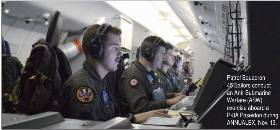
Patrol Squadron 45 Sailors conduct an Anti-Submarine Warfare (ASW) exercise aboard a P-8A Poseidon during ANNUALEX, Nov. 13.