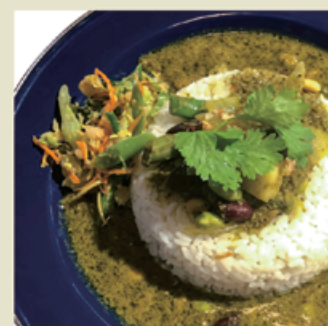
GREEN CURRY (BEANS)