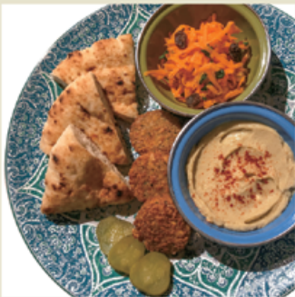
FALAFEL & HUMMUS