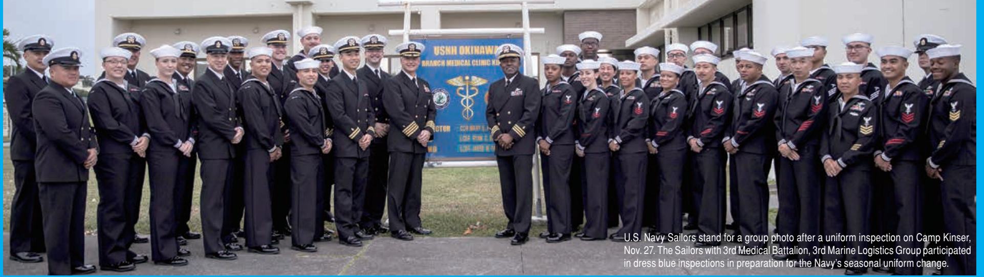
U.S. Navy Sailors stand for a group photo after a uniform inspection on Camp Kinser, Nov. 27. The Sailors with 3rd Medical Battalion, 3rd Marine Logistics Group participated in dress blue inspections in preparation for the Navy's seasonal uniform change.