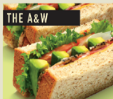
1F A&W PLUS CAFE