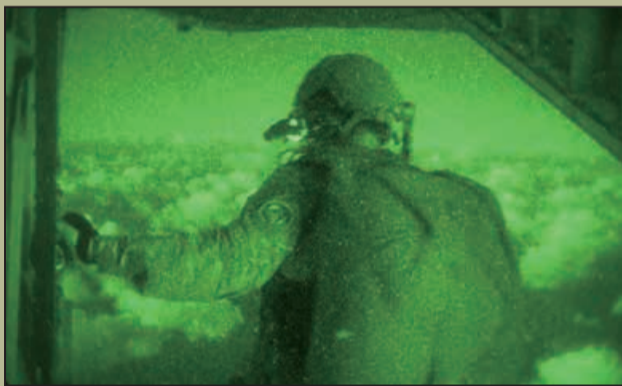
◀ A 320th Special Tactics Squadron jumpmaster overlooks Wake Island, Wake Atoll, during Exercise Gryphon Pacific 20-1, Nov. 15, over the Pacific Ocean. A Global Access Special Tactics team from the 320th STS conducted a military freefall jump to seize, establish, and control Wake Island Airfield. The 320th Special Tactics Squadron employs Special Tactics Operators capable of conducting Global Access, Precision Strike, and Personnel Recovery Operations.