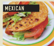
1F SEÑOR TACO