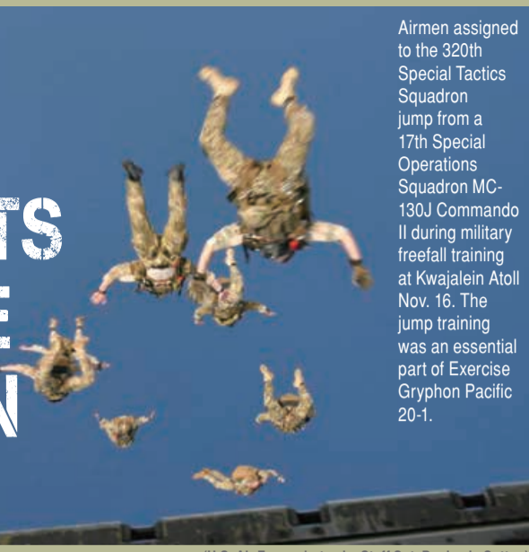
Airmen assigned to the 320th Special Tactics Squadron jump from a 17th Special Operations Squadron MC-130J Commando II during military freefall training at Kwajalein Atoll Nov. 16. The jump training was an essential part of Exercise Gryphon Pacific 20-1.