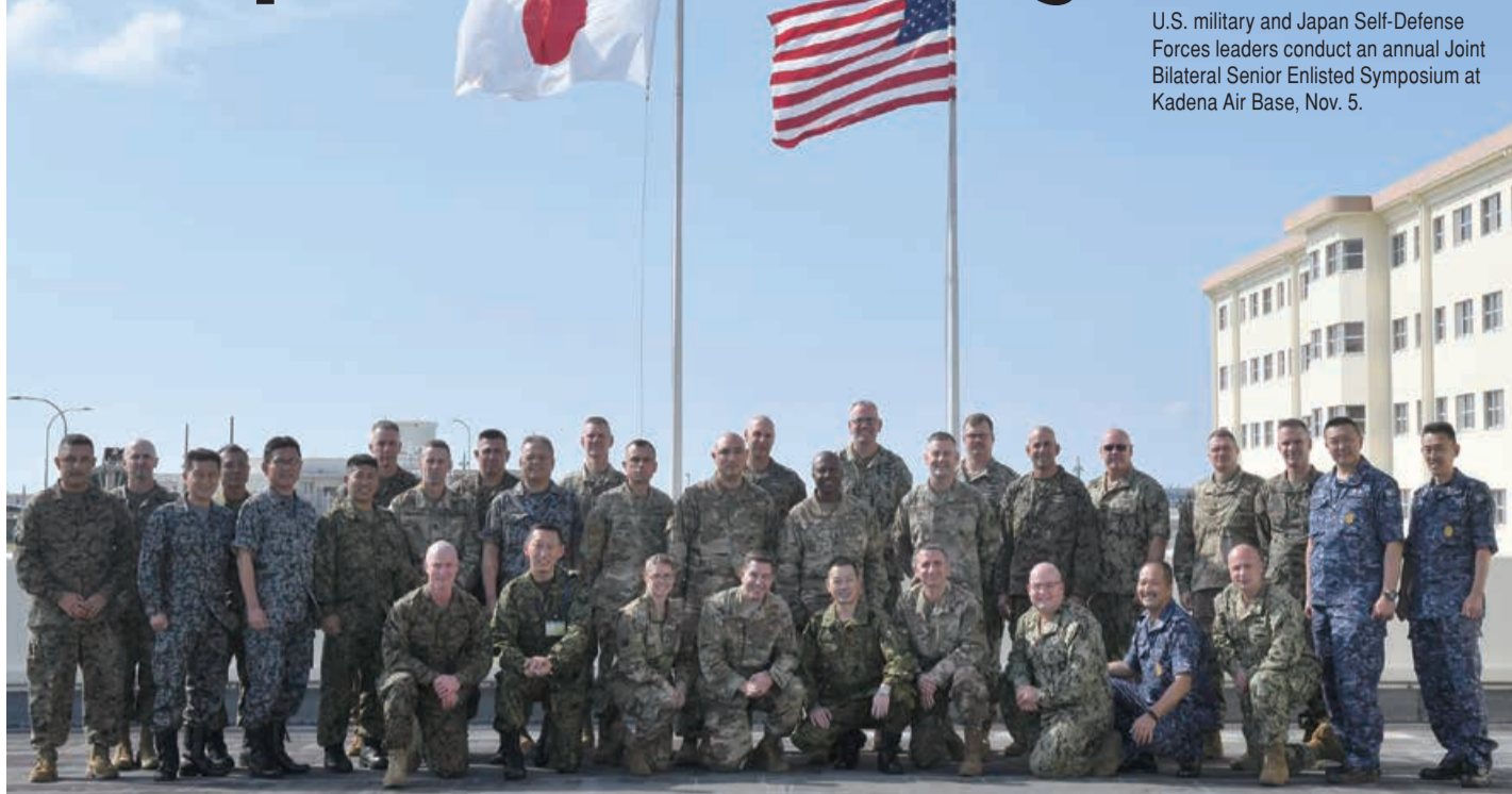
U.S. military and Japan Self-Defense Forces leaders conduct an annual Joint Bilateral Senior Enlisted Symposium at Kadena Air Base, Nov. 5.