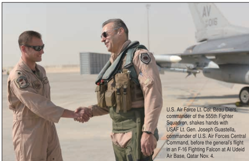
U.S. Air Force Lt. Col. Beau Diers, commander of the 555th Fighter Squadron, shakes hands with USAF Lt. Gen. Joseph Guastella, commander of U.S. Air Forces Central Command, before the general’s flight in an F-16 Fighting Falcon at Al Udeid Air Base, Qatar Nov. 4.