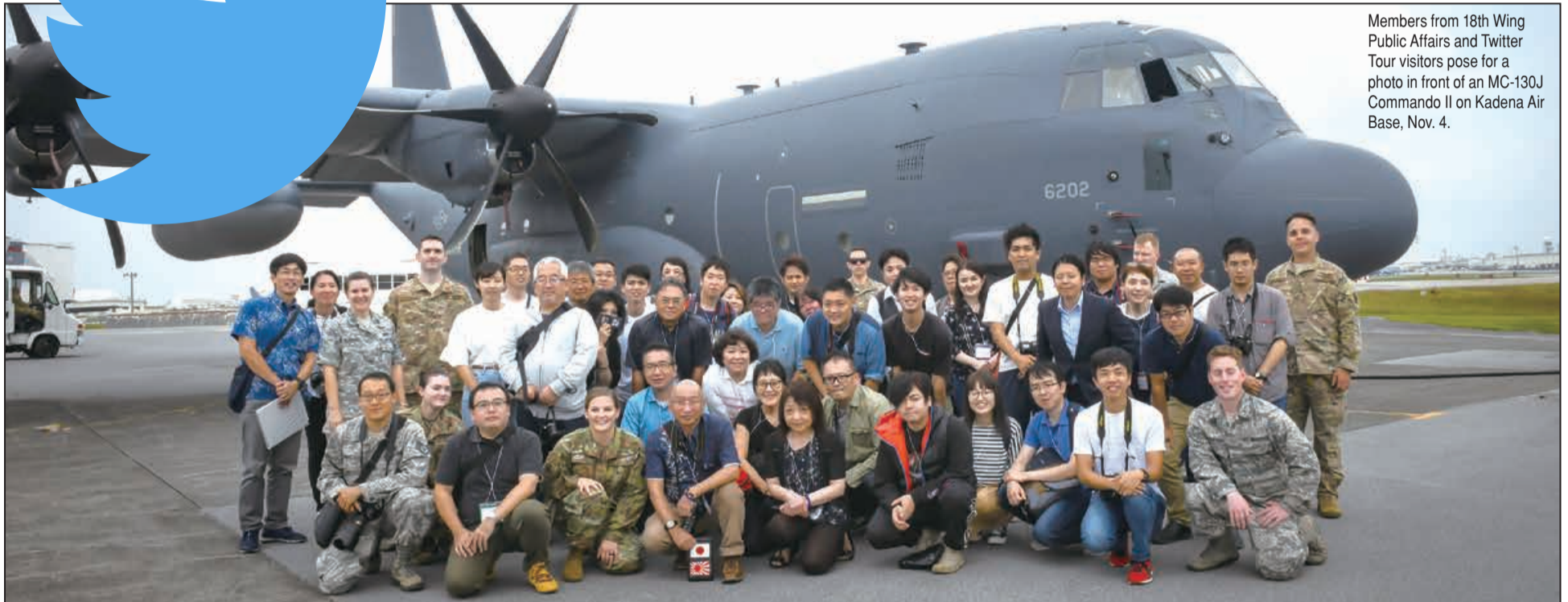
Members from 18th Wing Public Affairs and Twitter Tour visitors pose for a photo in front of an MC-130J Commando II on Kadena Air Base, Nov. 4.