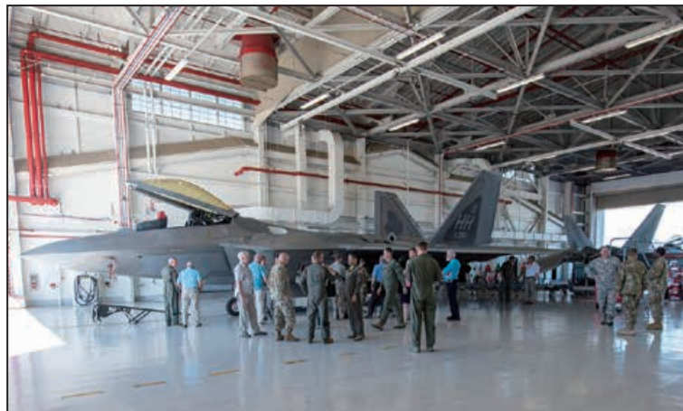
Members of the National Commission on Military Aviation Safety (NCMAS) take a tour of the F-22 Raptor facility Nov. 1, at Joint Base Pearl Harbor-Hickam.