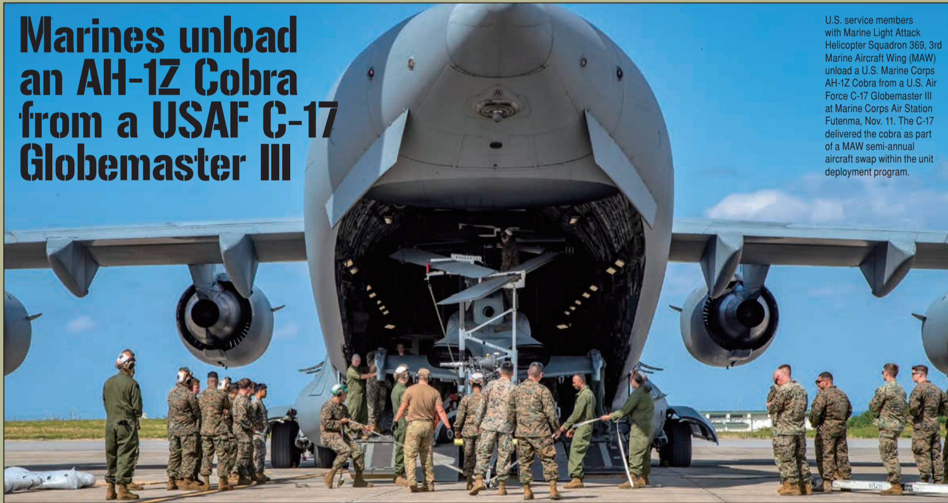
U.S. service members with Marine Light Attack Helicopter Squadron 369, 3rd Marine Aircraft Wing (MAW) unload a U.S. Marine Corps AH-1Z Cobra from a U.S. Air Force C-17 Globemaster III at Marine Corps Air Station Futenma, Nov. 11. The C-17 delivered the cobra as part of a MAW semi-annual aircraft swap within the unit deployment program.