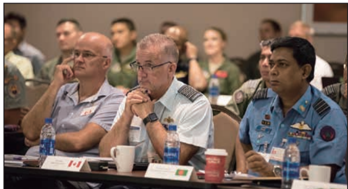
Attendees at the Indo-Pacific Safety Air Forces Exchange listen to a briefing on proactive aviation safety in Waikiki, Hawaii, Aug. 20.