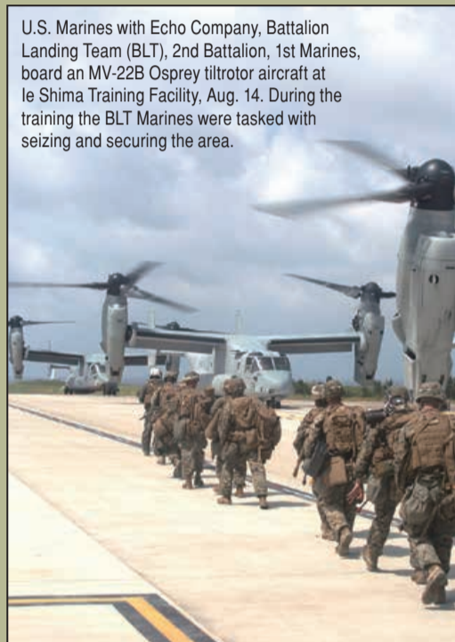
U.S. Marines with Echo Company, Battalion Landing Team (BLT), 2nd Battalion, 1st Marines, board an MV-22B Osprey tiltrotor aircraft at Ie Shima Training Facility, Aug. 14. During the training the BLT Marines were tasked with seizing and securing the area.