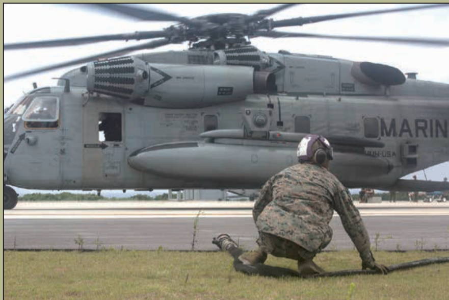
U.S. Marines with Marine Wing Support Squadron, Detachment 172, 31st Marine Expeditionary Unit, conduct an Air Delivered Ground Refueling exercise on a CH-53E Super Stallion at Ie Shima Training Facility, Aug. 14. This event shows the 31st Marine Expeditionary Unit's ability to quickly and efficiently perform a ground refueling in any given location. The establishment of a Forward Arming and Refueling Point from amphibious shipping demonstrates naval expeditionary integration across Marine Air-Ground Task Force capabilities and warfighting domains.