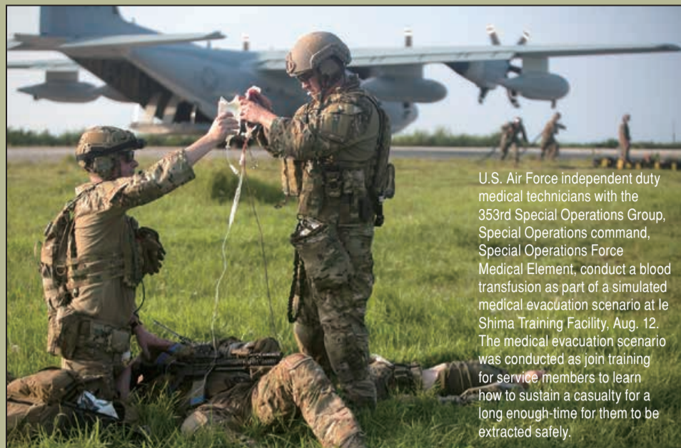
U.S. Air Force independent duty medical technicians with the 353rd Special Operations Group, Special Operations command, Special Operations Force Medical Element, conduct a blood transfusion as part of a simulated medical evacuation scenario at Ie Shima Training Facility, Aug. 12. The medical evacuation scenario was conducted as joint training for service members to learn how to sustain a casualty for a long enough-time for them to be extracted safely.