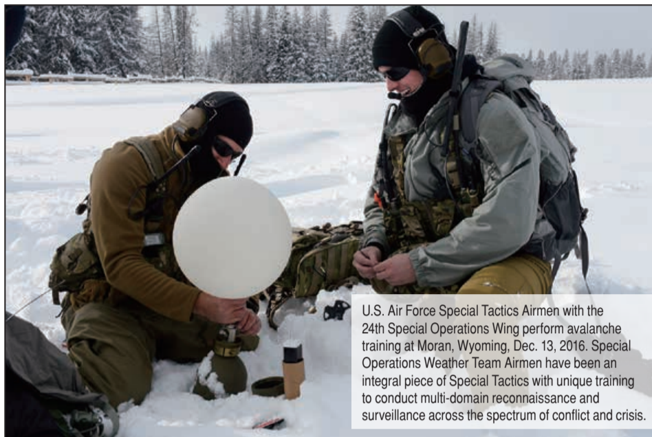
U.S. Air Force Special Tactics Airmen with the 24th Special Operations Wing perform avalanche training at Moran, Wyoming, Dec. 13, 2016. Special Operations Weather Team Airmen have been an integral piece of Special Tactics with unique training to conduct multi-domain reconnaissance and surveillance across the spectrum of conflict and crisis.