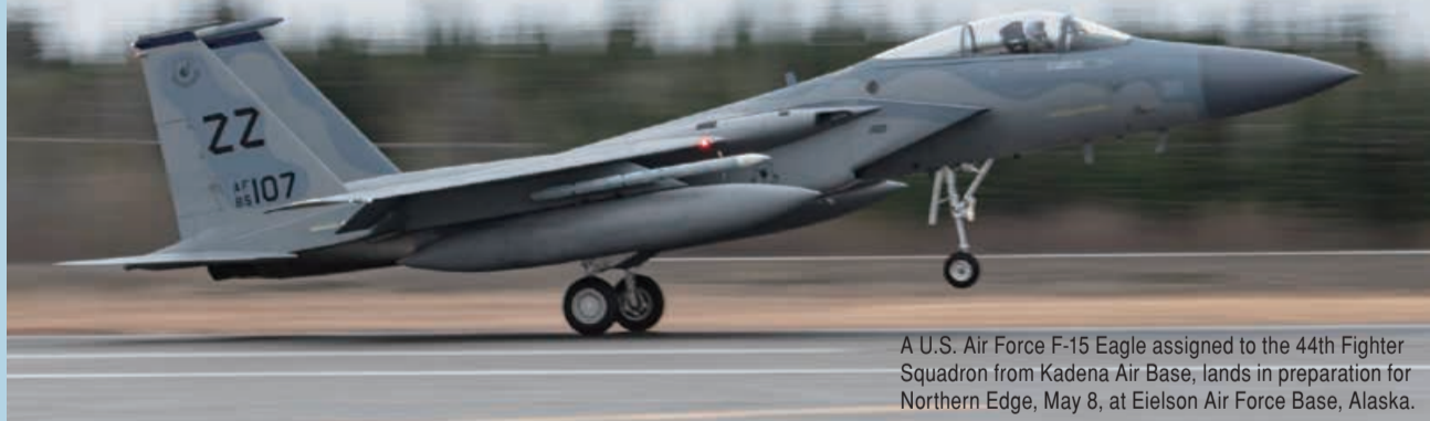
A U.S. Air Force F-15 Eagle assigned to the 44th Fighter Squadron from Kadena Air Base, lands in preparation for Northern Edge, May 8, at Eielson Air Force Base, Alaska.