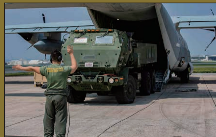
U.S. Marines with Sierra Battery, 3rd Battalion, 12th Marine Regiment, 3rd Marine Division prepare to load an M142 High Mobility Artillery Rocket System into an C-130 on Kadena Air Base, March 13.

A U.S. Marine with Sierra Battery, 3rd Battalion, 12th Marine Regiment helps guide the driver of a M142 High Mobility Artillery Rocket System towards an C-130 on Kadena Air Base, March 13. The Marines were preparing to participate in Expeditionary Advanced Base Operations.