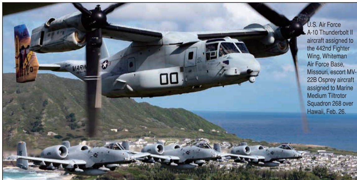
U.S. Air Force A-10 Thunderbolt II aircraft assigned to the 442nd Fighter Wing, Whiteman Air Force Base, Missouri, escort MV-22B Osprey aircraft assigned to Marine Medium Tiltrotor Squadron 268 over Hawaii, Feb. 26.