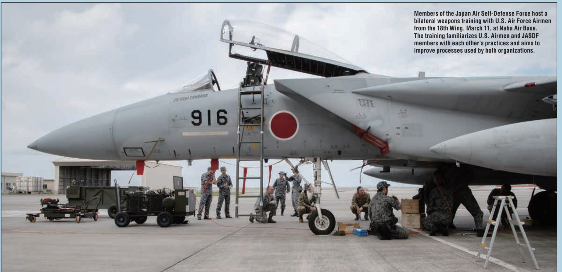
Members of the Japan Air Self-Defense Force host a bilateral weapons training with U.S. Air Force Airmen from the 18th Wing, March 11, at Naha Air Base. The training familiarizes U.S. Airmen and JASDF members with each other’s practices and aims to improve processes used by both organizations.