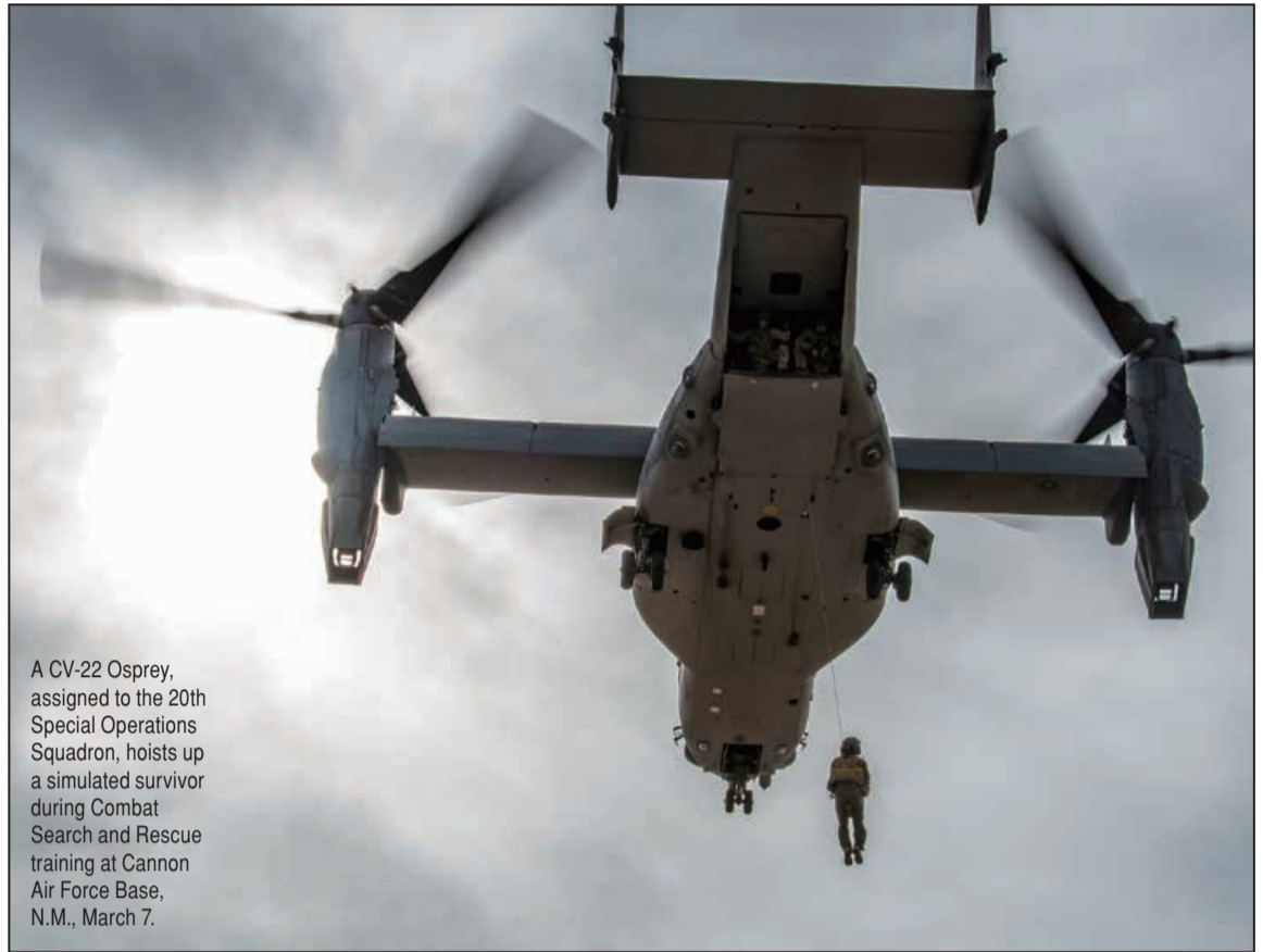
A CV-22 Osprey, assigned to the 20th Special Operations Squadron, hoists up a simulated survivor during Combat Search and Rescue training at Cannon Air Force Base, N.M., March 7.