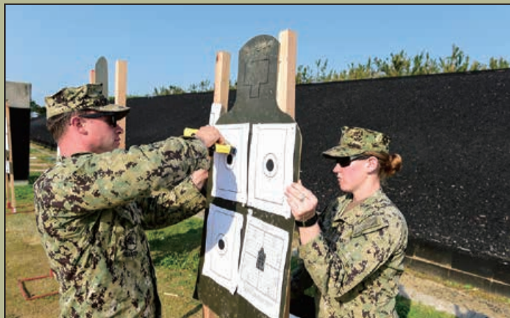
Seabees assigned to Naval Mobile Construction Battalion (NMCB) 3 fire M-4 rifles during a marksmanship qualification course onboard Camp Courtney Marine Corps Base, March 12.