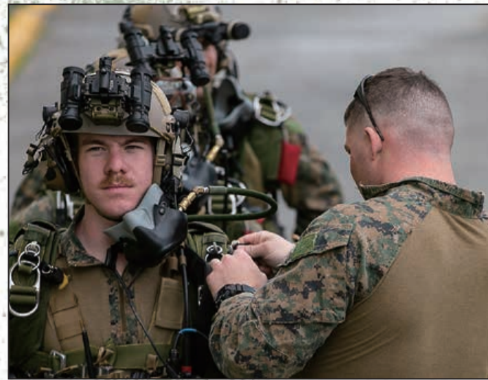
Marines with the 31st Marine Expeditionary Unit's Maritime Raid Force stand for a safety inspection before a military free-fall jump during simulated Expeditionary Advanced Base Operations, Marine Corps Air Station Futenma, March 11.