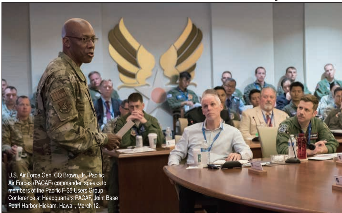
U.S. Air Force Gen. CQ Brown, Jr., Pacific Air Forces (PACAF) commander, speaks to members of the Pacific F-35 Users Group Conference at Headquarters PACAF, Joint Base Pearl Harbor-Hickam, Hawaii, March 12.