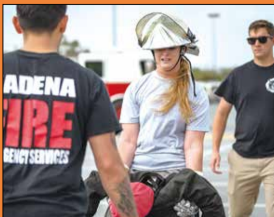
< A participant drags a dummy during the 2018 Fire Muster. The fire muster was one of many events hosted by the 18th Civil Engineer Squadron during Fire Prevention Week.