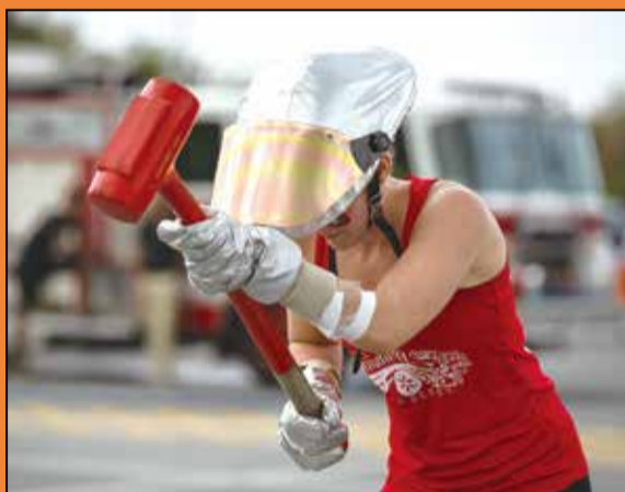
^ A participant swings a sledge hammer during the 2018 Fire Muster.