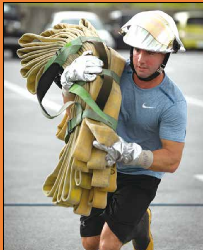
^ A participant runs an obstacle while carrying a hose during the 2018 Fire Muster.