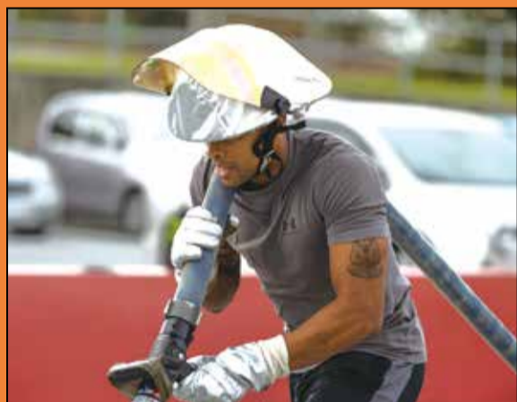
^ A participant pulls a hose during the 2018 Fire Muster.