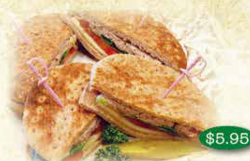
Swiss Tuna Sandwich

Tuna sandwich with light mayo, topped with tomato, swiss cheese and spinach in pita bread