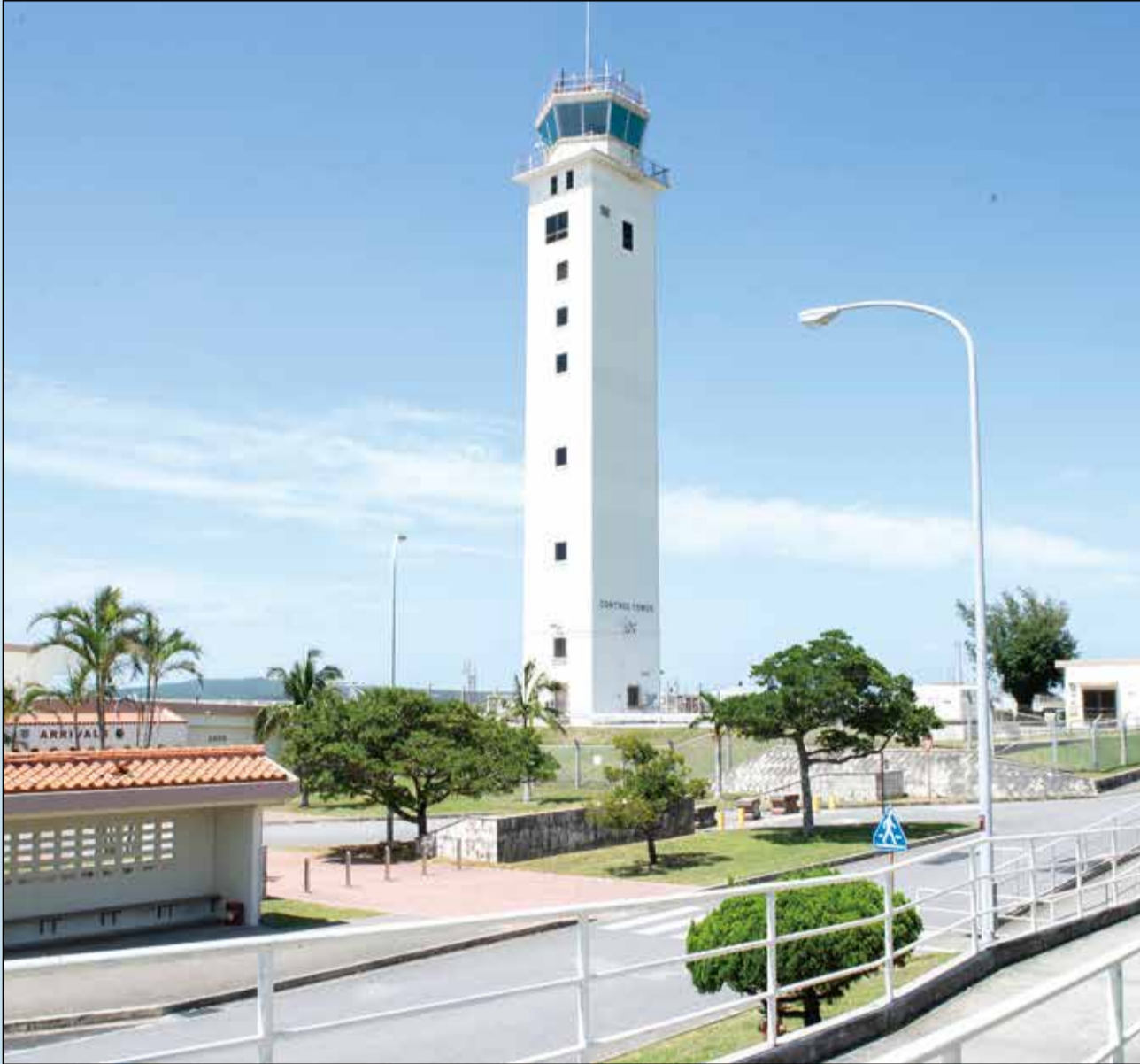
^ The Air Traffic Control tower overlooks the airfield at Kadena Air Base, May 24. The tower allows for successful operation of the airfield, both on and off the ground.