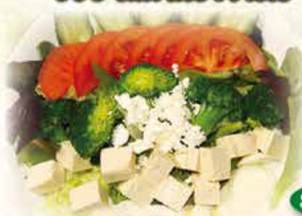
Chef Tofu Salad

A variety of greens topped with sliced boiled eggs, tomatoes, cucumber slices, broccoli spears, diced tofu and feta cheese