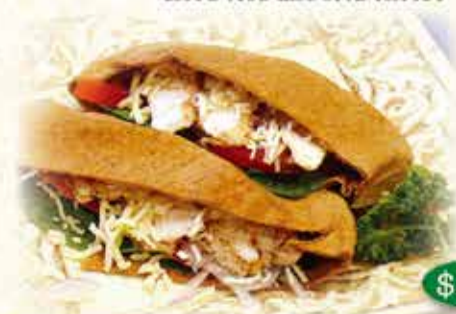
Chicken Monterey Flat

Chicken breast with BBQ sauce, topped with Monterey Jack cheese, tomato, spinach, red onions with a vinaigrette dressing in pita bread