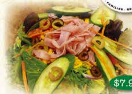
Cheesy Ham Salad

Mixture of assorted fresh green lettuce topped with shredded ham, cheddar cheese, red onion, tomatoes, olives, cucumbers, and shredded carrots