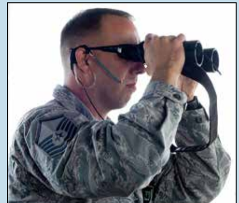
^ An air traffic controller with the 18th Operations Support Squadron at Kadena Air Base, watches over the airfield, May 18.