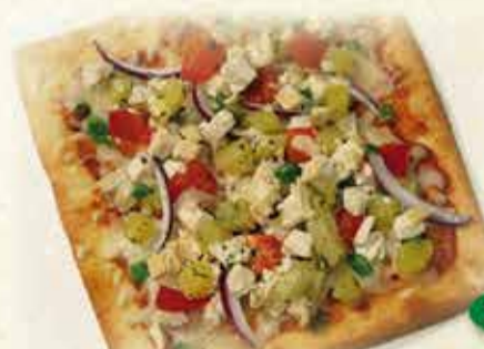
Malibu Chicken Flatbread Pizza

Herbal flat bread pizza with an overlay of tangy BBQ sauce, topped with shredded Mozzarella, diced marinated chicken and pineapple tidbits with tomato and red onion slices