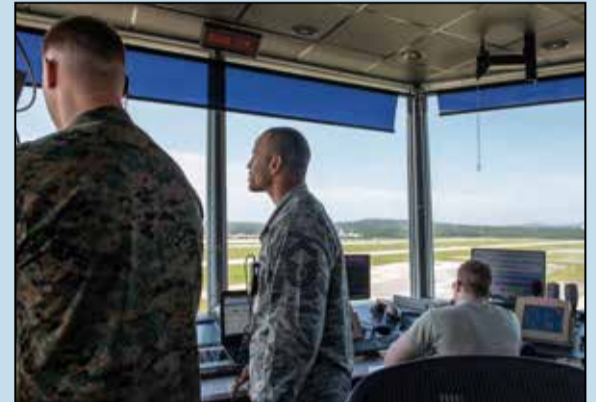
^ Air traffic controllers with the 18th Operations Support Squadron, monitor and direct the airfield at Kadena Air Base, May 24. Air traffic control relies on precise communication for success of the flying mission.