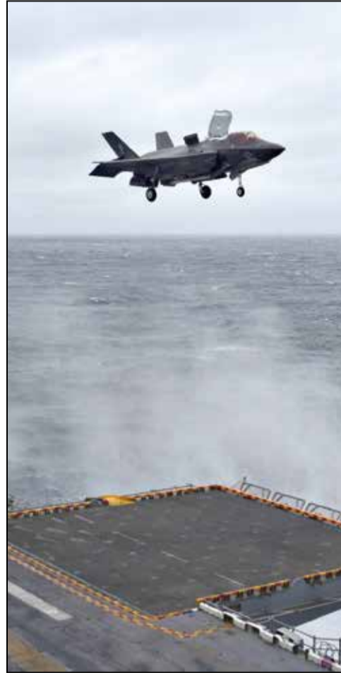
An F-35B Lightning II with Marine Fighter Attack Squadron (VMFA) 121 touches down on the amphibious assault ship USS Wasp (LHD 1), marking the first time the aircraft has deployed aboard a U.S. Navy ship and with a Marine Expeditionary Unit in the Indo-Pacific.