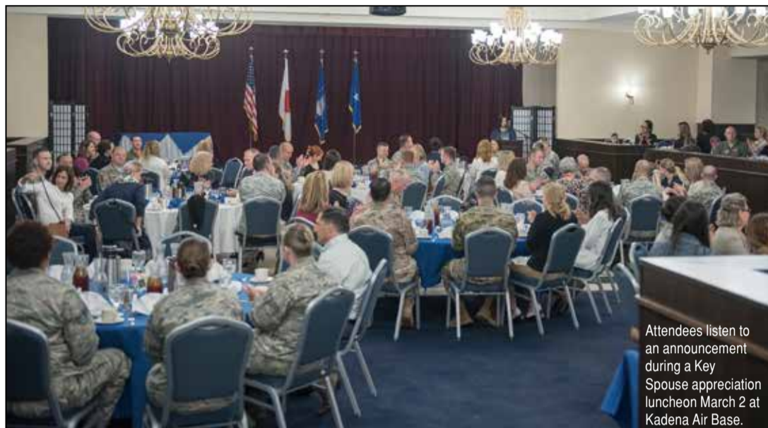
Attendees listen to an announcement during a Key Spouse appreciation luncheon March 2 at Kadena Air Base.