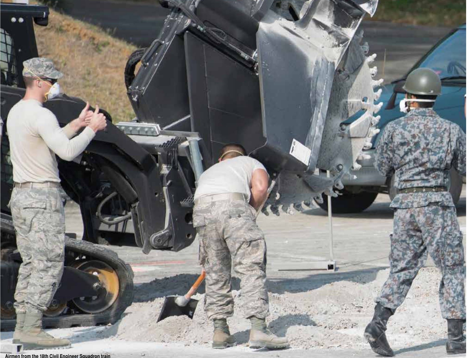
Airmen from the 18th Civil Engineer Squadron train members of the Japan Air Self-Defense Force on how to safely operate a compact tractor loader with a wheel saw during flightline repair training Feb. 28, at Kadena Air Base.