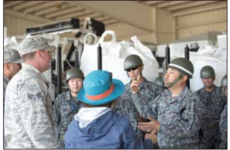
◀ Airmen from the 18th Civil Engineer Squadron train a member of the Japan Air Self-Defense Force on the correct operation of an impact hammer attached to an excavator during flightline repair training Feb. 28, at Kadena Air Base.