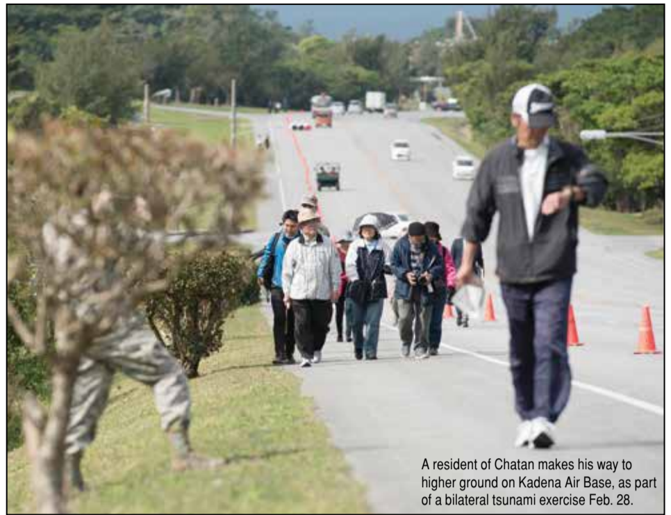
A resident of Chatan makes his way to higher ground on Kadena Air Base, as part of a bilateral tsunami exercise Feb. 28.