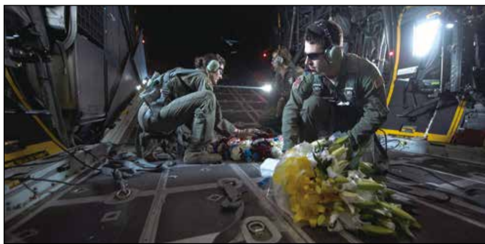
Crew members from the 1st Special Operations Squadron prepares a wreath and flowers to be dropped from an MC-130H Combat Talon II during a memorial flight off the coast of the Philippines Feb. 26.

Two of the lost passengers were 320th Special Tactics Squadron combat controllers. Members of the 320th STS attended