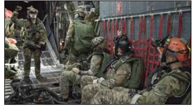
◀ A 320th Special Tactics Squadron troop commander talks with the 353rd SOG and 320th STS commanders Feb. 20, at Chandy Range, Thailand.