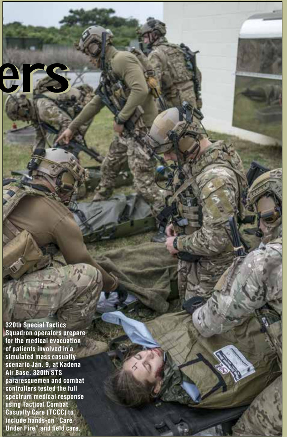
320th Special Tactics Squadron operators prepare for the medical evacuation of patients involved in a simulated mass casualty scenario Jan. 9, at Kadena Air Base. 320th STS pararescuemen and combat controllers tested the full spectrum medical response using Tactical Combat Casualty Care (TCCC) to include hands-on "Care Under Fire" and field care.