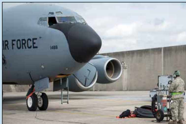
^ KC-135R crew chiefs from the 909th Aircraft Maintenance Unit, perform an engine power run Jan. 25, at Kadena Air Base. KC-135R Stratotanker crew chiefs look for discrepancies such as leaks, smoke or damage during a power-run.