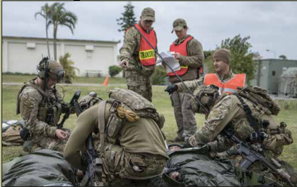
353rd Special Operations Support Squadron Operations Support Medicine (OSM) independent duty medical technicians (IDMTs) and flight doctor evaluate the medical response provided by 320th Special Tactics Squadron operators during a simulated mass casualty scenario Jan. 9, at Kadena Air Base. Special Operations Forces Medical Element (SOFME) personnel evaluated 320th STS pararescuemen and combat controllers on their rapid action, decision making and technical performance of medical interventions during the scenario-based training.