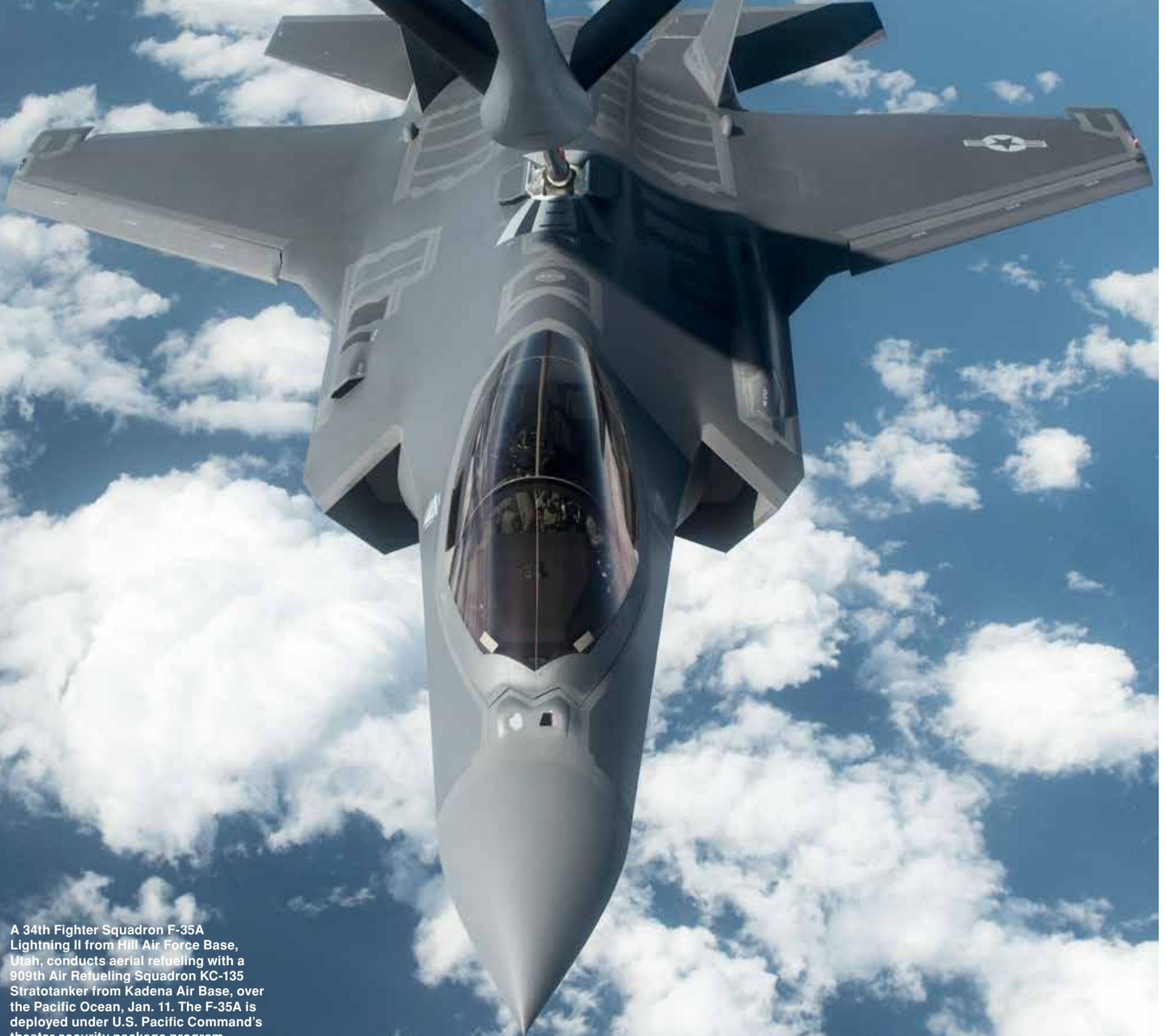
A 34th Fighter Squadron F-35A Lightning II from Hill Air Force Base, Utah, conducts aerial refueling with a 909th Air Refueling Squadron KC-135 Stratotanker from Kadena Air Base, over the Pacific Ocean, Jan. 11. The F-35A is deployed under U.S. Pacific Command's theater security package program, which has been in operation since 2004.