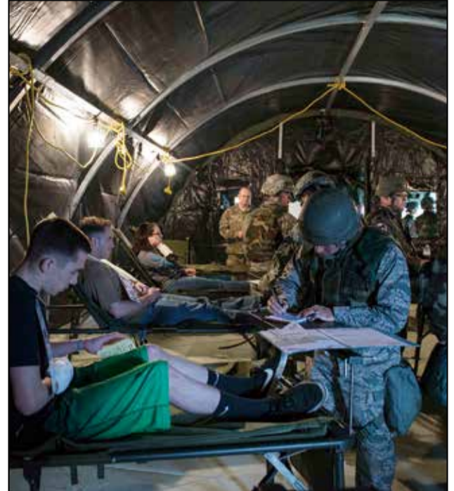
^ Volunteers receive simulated medical care in an En Route Patient Staging System during a field training exercise Jan. 26. The 18th Medical Group tested their ability to treat and transport a large amount of patients.