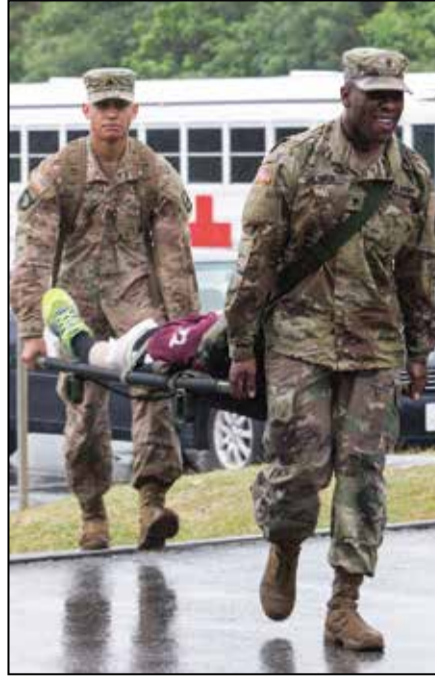
^ A simulated patient is loaded for transportation during a joint field training exercise, Jan. 26, at Kadena Air Base. The U.S. Army and Navy assisted with transporting and caring for the wounded patients.