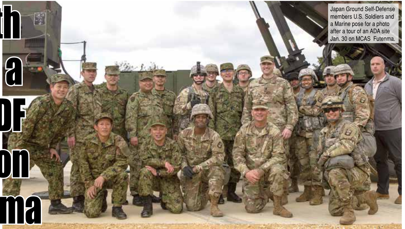
Japan Ground Self-Defense members U.S. Soldiers and a Marine pose for a photo after a tour of an ADA site Jan. 30 on MCAS Futenma.