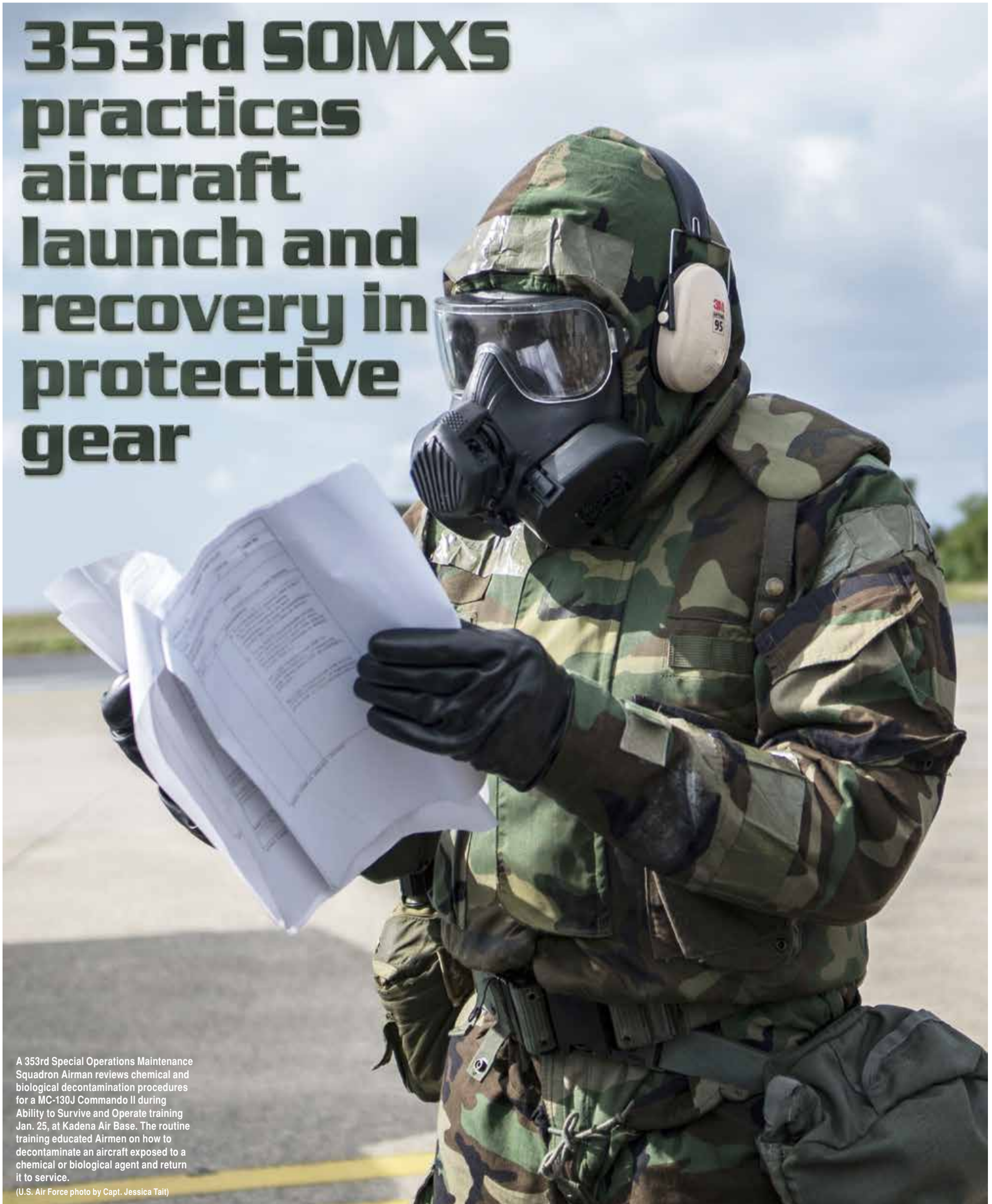
A 353rd Special Operations Maintenance Squadron Airman reviews chemical and biological decontamination procedures for a MC-130J Commando II during Ability to Survive and Operate training Jan. 25, at Kadena Air Base. The routine training educated Airmen on how to decontaminate an aircraft exposed to a chemical or biological agent and return it to service.