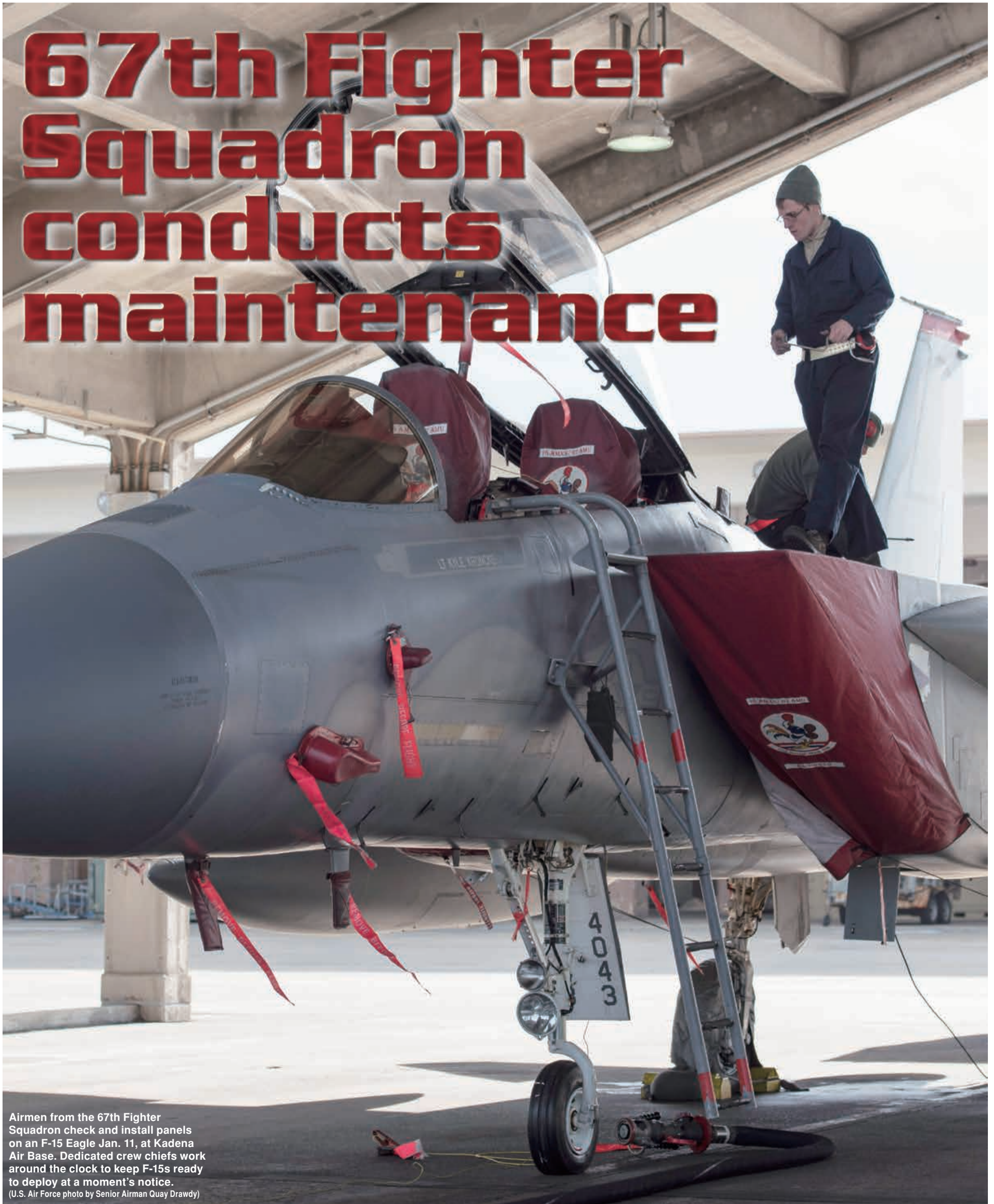
Airmen from the 67th Fighter Squadron check and install panels on an F-15 Eagle Jan. 11, at Kadena Air Base. Dedicated crew chiefs work around the clock to keep F-15s ready to deploy at a moment's notice.