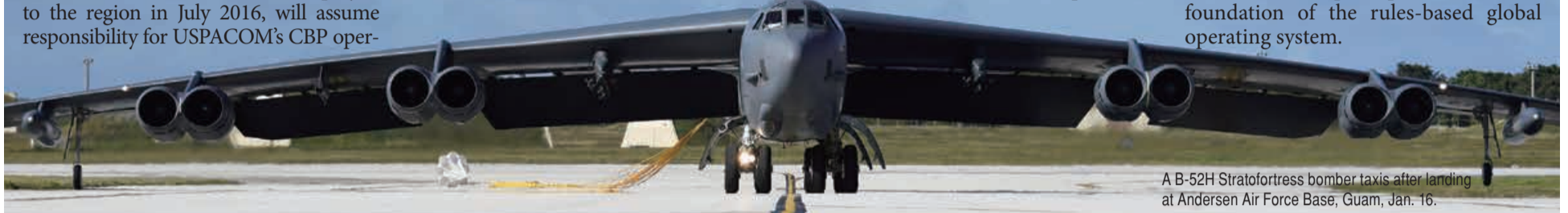
A B-52H Stratofortress bomber taxis after landing at Andersen Air Force Base, Guam, Jan. 16.

The employment of CBP missions in the USPACOM area of responsibility, conducted since March 2004, are in accordance with international law and are vital to the principles that are the foundation of the rules-based global operating system.