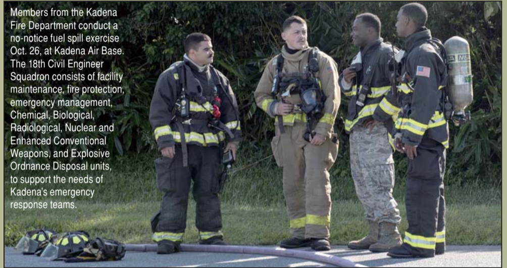
Members from the Kadena Fire Department conduct a no-notice fuel spill exercise Oct. 26, at Kadena Air Base. The 18th Civil Engineer Squadron consists of facility maintenance, fire protection, emergency management, Chemical, Biological, Radiological, Nuclear and Enhanced Conventional Weapons, and Explosive Ordnance Disposal units, to support the needs of Kadena's emergency response teams.