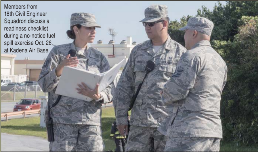
Members from 18th Civil Engineer Squadron discuss a readiness checklist during a no-notice fuel spill exercise Oct. 26, at Kadena Air Base.