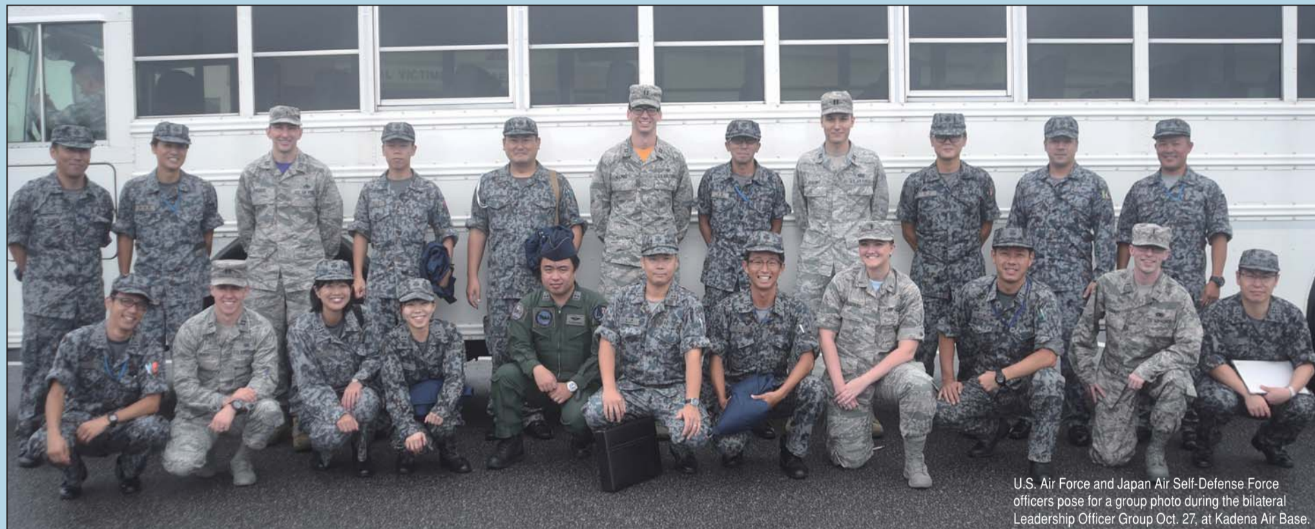
U.S. Air Force and Japan Air Self-Defense Force officers pose for a group photo during the bilateral Leadership Officer Group Oct. 27, at Kadena Air Base.