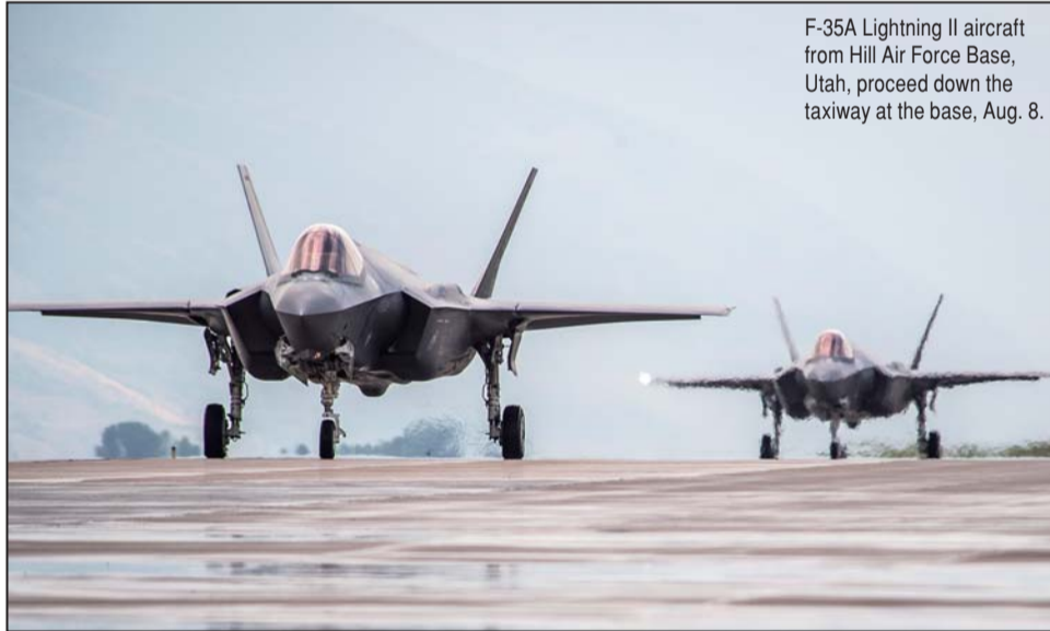
F-35A Lightning II aircraft from Hill Air Force Base, Utah, proceed down the taxiway at the base, Aug. 8.