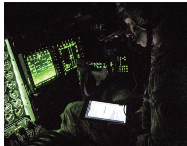
◀ 353rd Special Operations Maintenance Squadron personnel work on a U.S. Air Force 1st Special Operations Squadron MC-130H Combat Talon II in preparation for helicopter air-to-air refueling with U.S. Army 160th Special Operations Aviation Regiment MH-60M Blackhawks Sept. 24, at Clark Air Base, Philippines.