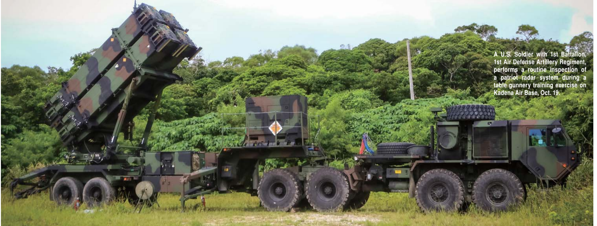
A U.S. Soldier with 1st Battalion, 1st Air Defense Artillery Regiment, performs a routine inspection of a patriot radar system during a patriot radar system training exercise on Kadena Air Base, Oct. 19.