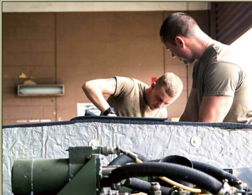
Two Soldiers with 1st Battalion, 1st Air Defense Artillery Regiment, makes repairs to a generator installing new parts during a routine maintenance repair on Kadena Air Base, Oct. 18.