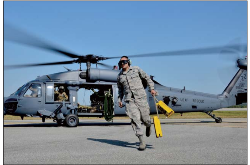
Members of the 33rd Rescue Squadron and 31st Rescue Squadron from Kadena Air Base, prepare for a combat search and rescue mission during Exercise Pacific Thunder 18-1 at Osan Air Base, Oct. 23. This year's exercise is the largest Pacific Thunder hosted at Osan with more than 20 U.S. squadrons and nine ROK wings participating.