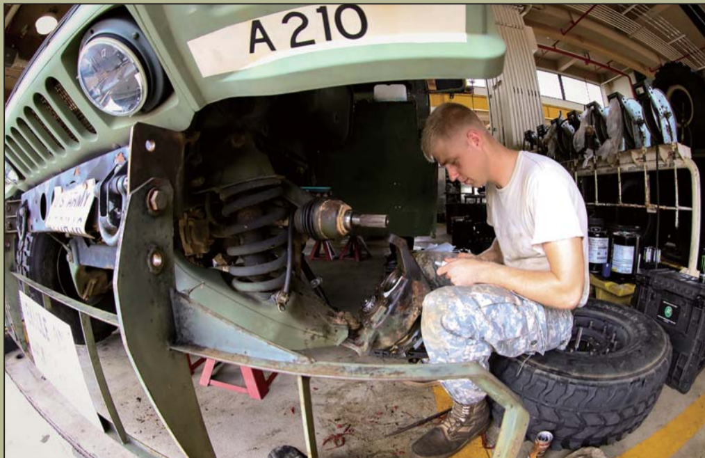
A wheeled vehicle mechanic Soldier with 1st Battalion, 1st Air Defense Artillery Regiment, makes repairs to a High Mobility Multipurpose Wheeled Vehicle (HMMWV) tire hub on Kadena Air Base, Oct. 18.