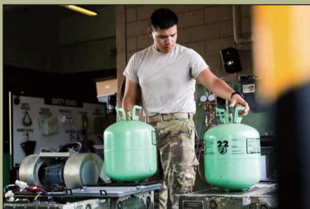
A utilities equipment repairer Soldier with 1st Battalion, 1st Air Defense Artillery Regiment, prepares to perform repairs to an air conditioner unit during a scheduled maintenance repair on Kadena Air Base, Oct. 18.