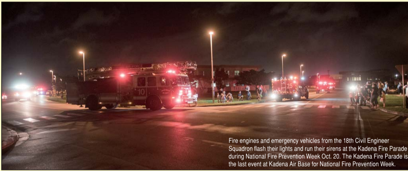
Fire engines and emergency vehicles from the 18th Civil Engineer Squadron flash their lights and run their sirens at the Kadena Fire Parade during National Fire Prevention Week Oct. 20. The Kadena Fire Parade is the last event at Kadena Air Base for National Fire Prevention Week.