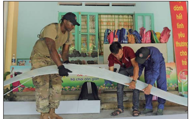
◀ Airmen work alongside their counterparts from the Vietnam People's Army to install ceiling fans at a school during Pacific Angel 17-2 in Tam Ky, Quang Nam Province, Vietnam, Sept. 11.