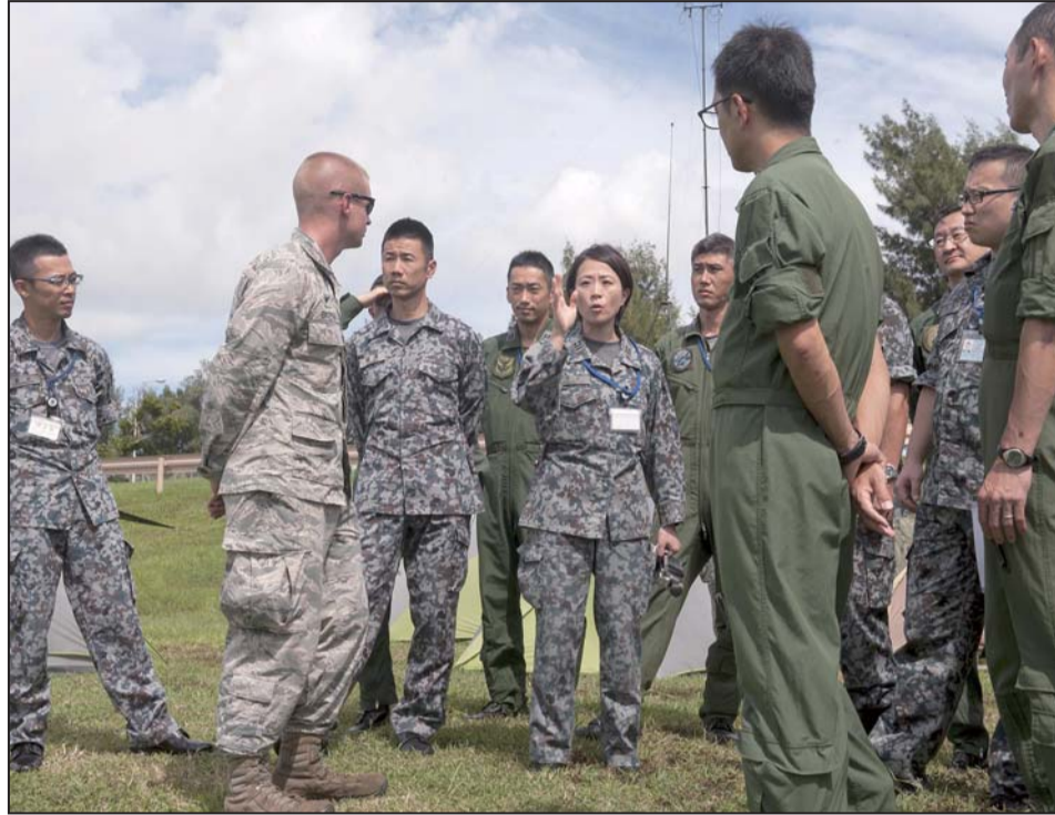
Members from the U.S. Air Force, the Japan Air Self-Defense Force, and the Royal Australian Air Force, observe and discuss fueling operations during exercise Tropic ACE Aug. 29, at Kadena Air Base.