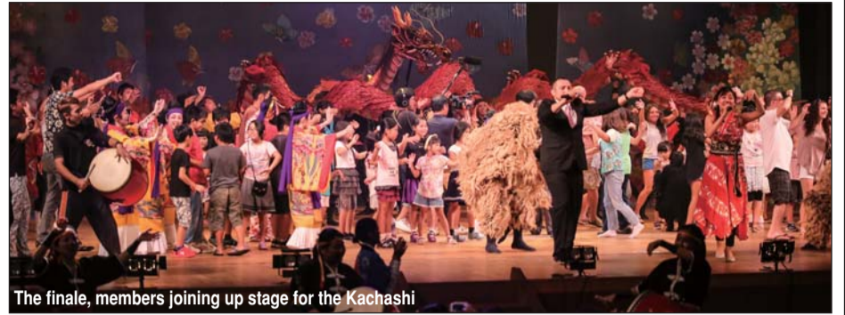
The finale, members joining up stage for the Kachashi