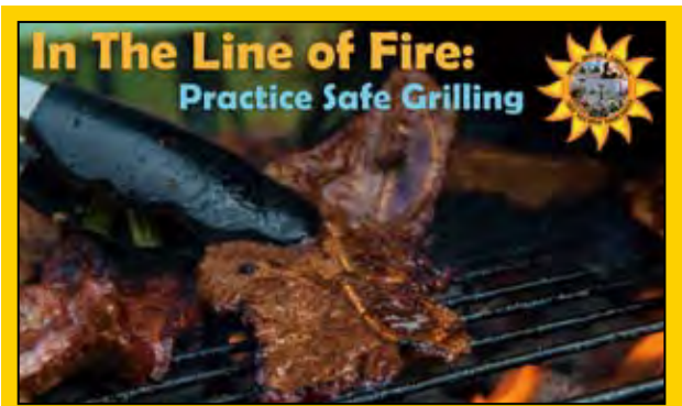
(U.S. Air Force illustration by Airman 1st Class Ryan Callaghan)